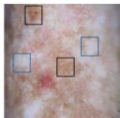
Figure 2d: Dermatoscopic findings-Blue arrow-white hair; black arrow-hypertrichosis