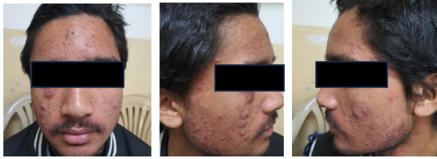
Figure 1a: Clinical findings of acne and erythema in 23 yrs old male patient using clobetasol propionate 0.05% cream for 1 month for treatment of acne.