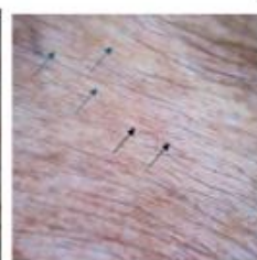
Figure 2c: Dermatoscopic findings-Blue box-white structureless areas; black box-brown globules