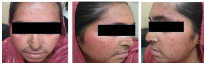
Figure 2a: Clinical findings of hyperpigmentation, hypertrichosis, telangiectasias, erythema, and atrophy in 32 yrs old female patient after using betamethasone dipropionate .05% cream for 7 months