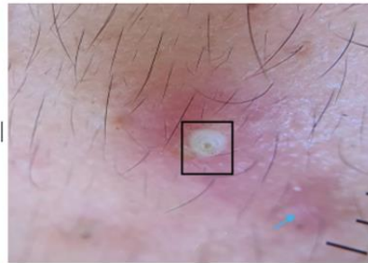
Figure 1c: Dermatoscopic findings blue arrows -papules; black box-pustules