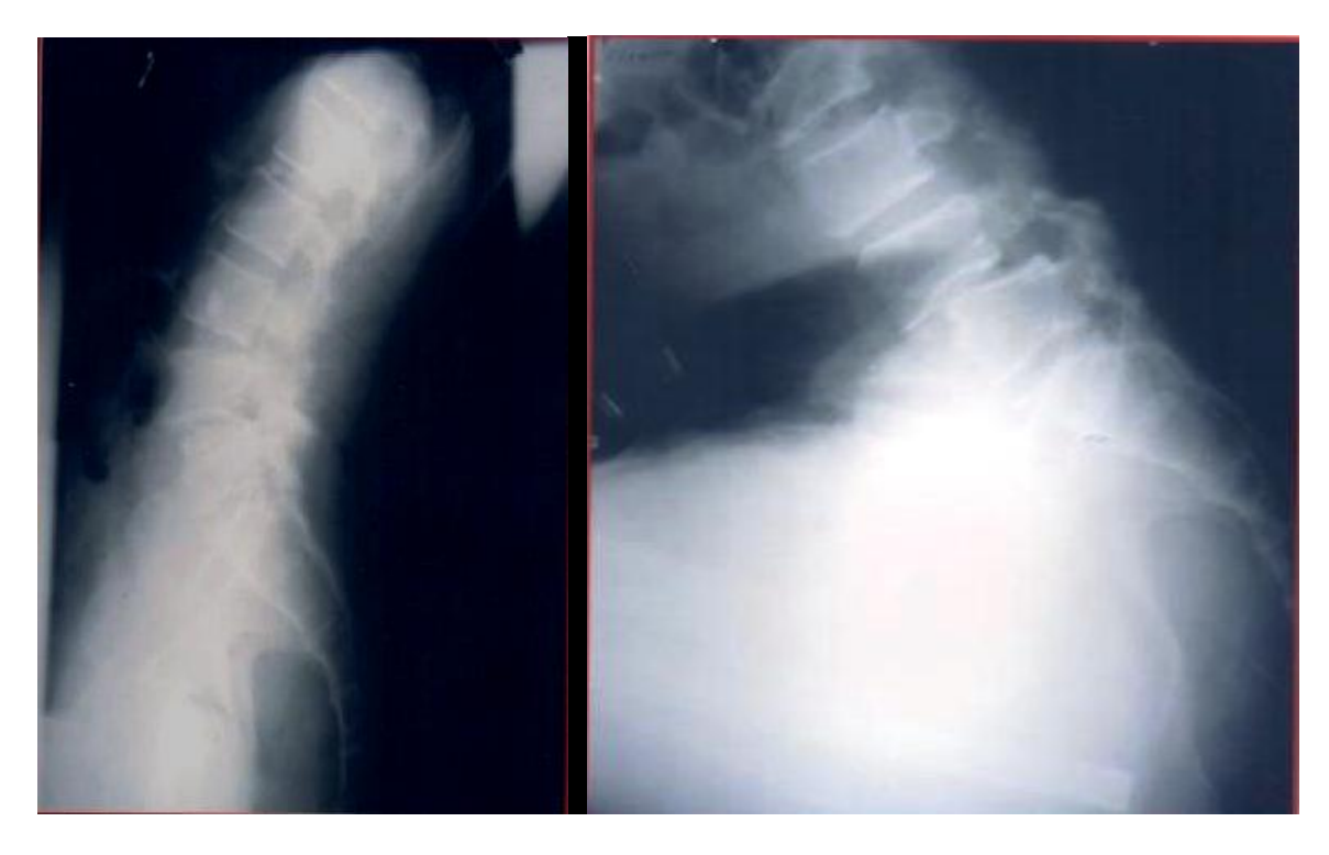
Fig 5: Extension radiograph of aspondylolisthesis patient