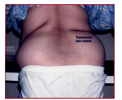
Fig 1: Clinical profile from posterior aspect

There were 20 patients of which seven were males and 13 were females in the age group from 24 years to 65 years. The mean age was 39.9 years. Most of them were in the fifth decade. A detailed history was elicited in all these 20 patients regarding characteristics of low backache with particular emphasis on morning stiffness and thorough clinical examination done to perceive structural deformities, alterations in movements of spine and specific area of tenderness. (Figure 1 and 2).