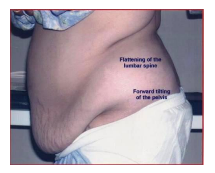
Fig 2: Clinical profile from lateral aspect

Standard antero-posterior and lateral radiographs, as well as oblique views of lumbosacral spine were taken, Flexion- extension radiographs were taken. A strong triangular wooden blog with cushions under the knees and the patients leans forward for the flexion radiographs. (Figure 3) For extension radiographs, the patient was made to stand on a slanting wooden platform on the floor, at the end of the examination table pressing the legs firmly against it and leaning backwards at the level of lumbosacral junction, with hands on the table for support. (Figure 4) Each film was made in a standard fashion with a tube-film distance of 40 inches.