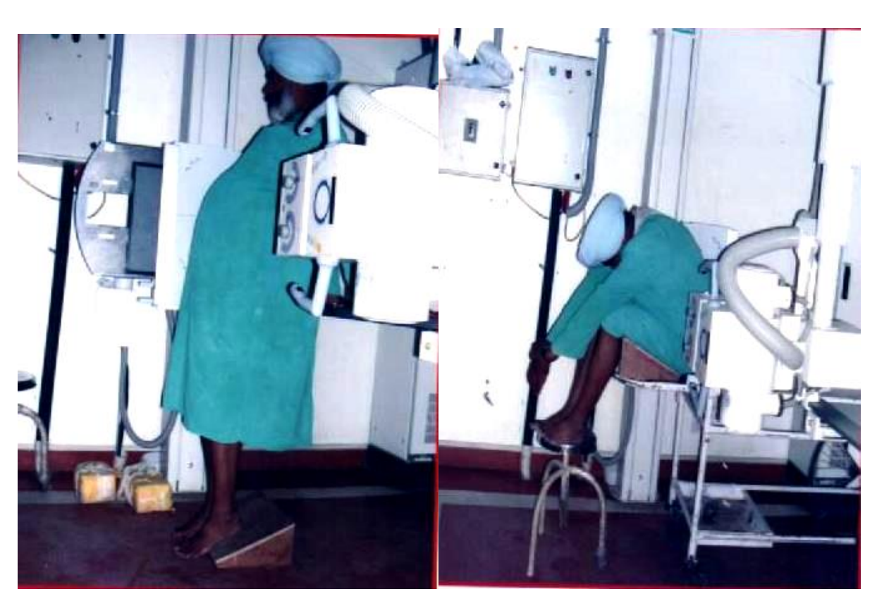
Fig 3: Extension view