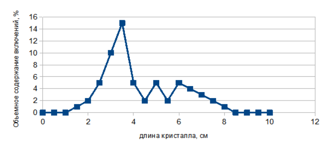
Figure 3: Inclusions dispersion through the crystal's length