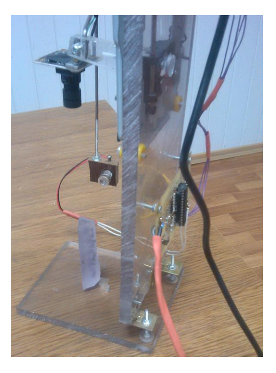
Figure 1: The scheme and the facility appearance; 1 – camera; 2 – the lights; 3 – crystal; 5 – table; 6 – incremental driver

This strategy was developed to define defects, which are more than 40 Microns. The camera optical system focal length can be calculated in the following equation: