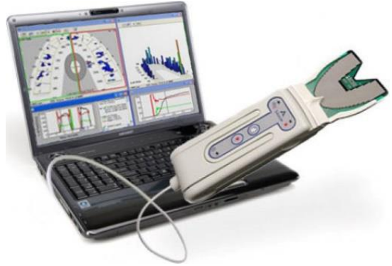
Figure 5: T Scan III

First T Scan model was presented in 1987, and ever since manufacturer improved it till the last third generation. Improvements were made in the system's accuracy, sensitivity and reproducibility [20]. The T-Scan III System is a dental device used to analyze relative occlusal force that is recorded intraorally by a pressuremapping sensor. The recorded force data is stored on a hard drive, and can be played back for data analysis in a time-based dynamic video. It consists of a piezoelectric foil sensor, a sensor handle, both hardware and software for recording, analyzing and viewing the data. The T-scan identifies the time magnitude and the distribution of the occlusal contacts (Fig. 5).