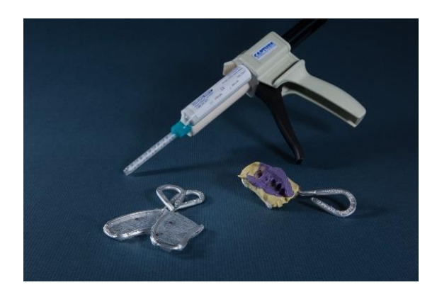
Figure 4: Dual arch impression trays

Another method for occlusal registration is dual arch impression taken with dual arch tray, which offer the ability to simultaneously take a working model, opposing model and bite registration (fig.4). Bite registration provided by dual arch impressions provides superior maximum intercuspal relationships over full arch models, if done correctly [18, 19].