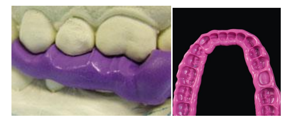
Figure 3: Vinyl Polysiloxane for occlusal registration

Very often dentists use flexible materials like addition silicones - vinyl polysiloxane VPS (putties and pastes), injectable or hand mixed, but with their use it is very hard to find the exact position of the casts. It is because of spring back when the material is compressed, which allow a wide range of possible locations. Shrinkage during the polymerization process and distortion occurs if the material is removed from the mouth before it reached its complete set [17] Fig 3.