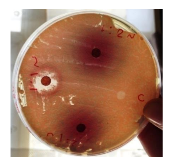
Figure (3): effect of silver nanoparticles on the yeast R. glutinis

( Acrodictys fimicola ) from the damaged bond, and the prevention of pollution in documents. Our results agreed with results of previous studies [7, 10].