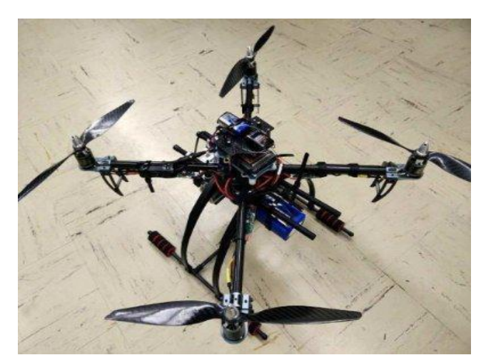
Figure 2. Assembled quadcopter test bed.

In request to achieve this, NTM Prop Drive 28-30 800kv BLDC engines were chosen to give push utilizing 12x6 carbon fiber propellers. The low kv rating gives high torque to bring down rotational velocities to drive the substantial props. Basic testing of these engines, utilizing a trademark push stand, demonstrates that each engine and propeller blend give 900 grams of push to 150 Watts. Additionally push testing at most extreme yield at 300 Watts demonstrate an expansion in push to 1.3 kilograms of push. This outcomes in a push to weight proportion of 2.8 which leaves additional push limit with regards to a camera or different assistants to be included later on. Afro electronic speed controllers (ESCs) are utilized to control the propeller and engine rotational speed and can be seen on the privilege in Figure 3. The stock ESCs has a refresh rate of 50Hz which are enhanced by utilizing SimonK firmware to get higher refresh rates up to 400Hz to summon rotational speed.