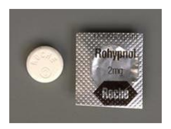
Figure 4: Open Tablet of Rohypnol 2mg Drug manufactured by Roche

The Rohypnol drugs came out in solid dosage form tablet in dose of one and two milligrams.