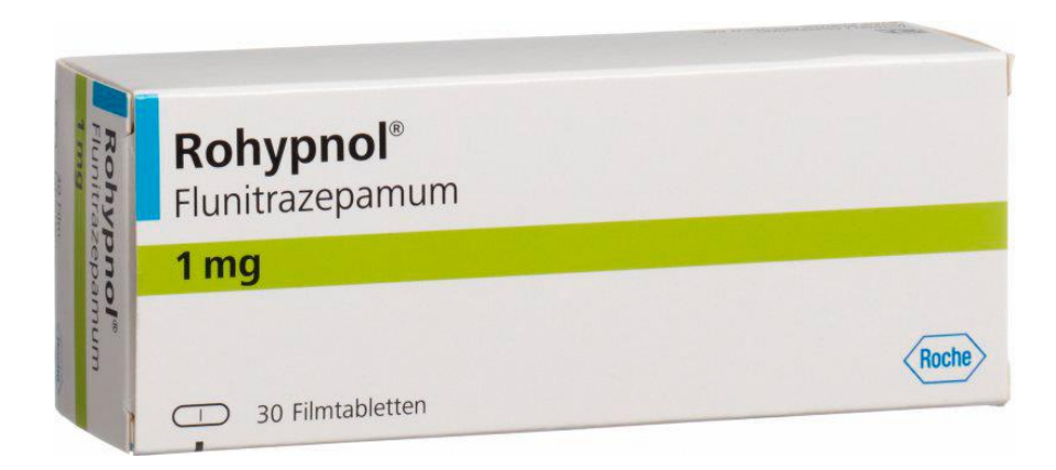
Figure 1: Prepared Drug by Roche

Flunitrazepam or Rohypnol is a powerful sedative hypnotic or a central nervous system depressant drug. Rohypnol is the family member of benzodiazepine which include Valium and Xanax. It's about more than 10 times the capability of Valium. Flunitrazepam use began gaining fame in the United State in early 1990s but The Rohypnol is banned in United State and not available legally, it also not approved for medical treatment used in United State. Rohypnol is manufactured or Prepared by Hoffman-La Roche. Rohypnol is known as The Date Rape Predator Drug because the drug is infrequently given to heedless victims without their permission.