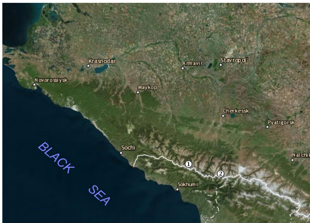
Pic. 1. The scheme of location study landscapes

Unlike the Main Caucasus Range, the Lateral Range is not a continuous mountain chain; it is divided into autonomous mountain groups by transverse faults. It has an east-west trending from Fisht – Oshten to Kazbek, so climate differences contributed to the formation of longitudinal differences in climate conditions and to the appearance of physiographic districts – Labino-Teberdinskiy district of dark coniferous forests and subalpine meadows, Teberdino-Elbrusskiy district of pine- and fir-tree forests and alpine meadows and Kubano-Terskiy district of pine-tree forests and alpine meadows (pic. 1).