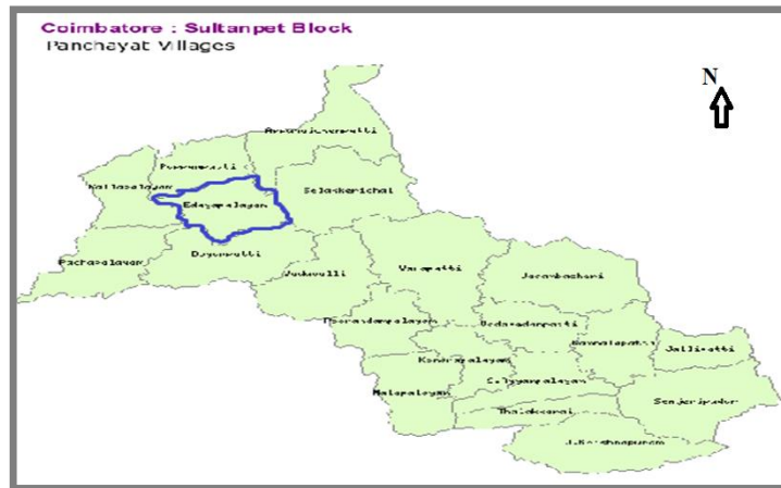
Fig 2. Study area map of Ettimadai and Malumichampatti