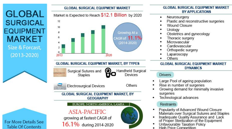
Figure No 2

Minimal invasive surgery offer huge benefits for patients as well as surgeons such as fast recovery, fewer post surgery infections, condensed visible marks, bleeding control and improved accuracy are some of the major drivers of electro surgical market. Increasing risk of side effects from these electro surgery devices is one of the major challenges hindering the market growth. Other factors consists of rising trends in purchasing in bulk through group health organizations and through integrated health networks which creates increasing price pressure on the market players.