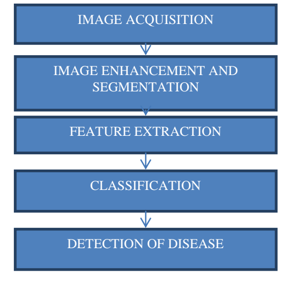
Fig.3.1 Work flow