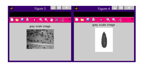
Fig.3.2 Grayscale images