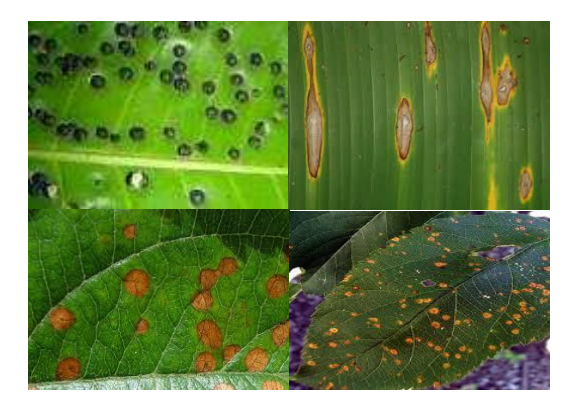
Fig 1: Sample input images

First, the image is converted to the grayscale image. The function of G = rgb2gray (Z) is used to convert into the grayscale image. Then, the intensity of image is adjusted by calling function that specifies the lower and upper picture elements each of one percent that are used for dissimilaritystretching the grayscale image.