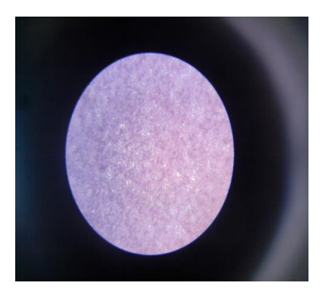
Figure 2: Microscopic image of Staphylococcus sp.