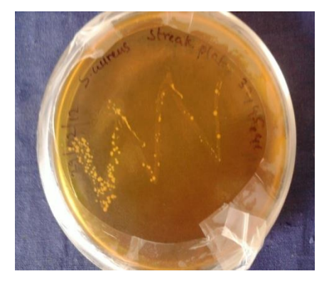
Figure 1:Streak Plate of Staphylococcus sp.

To further identify the organism, biochemical tests like catalase, coagulase, oxidase, indole production test, methyl red test, Vogerproskauer test and mannitol tests were conducted. The results are represented in Table No.2, Figure No. 3 and 4. It was observed that catalase, coagulase, methyl red test, Vogerproskauer test and mannitol tests are positive and oxidase, indole production test are negative for all the tested drinking water samples collected from Guntur, Krishna and Prakasam Dt., of A.P. Similarly, the bacterial contamination in drinking water samples collected from some rural habitats of northern Rajasthan, India <sup>[11]</sup> and the distribution of staphylococci and their resistance trends in different types of water was also assessed <sup>[6].</sup> Tortora et al., <sup>[12]</sup> reported that in general Staphylococcus occurs in water that contains organic pollutants i.e., mineral ions, and organic matter contents. The organic matter content may provide a better environment for the development of this bacterium in water sources. The occurrence of this bacterium in drinking water samples may indicate the mixing of runoff water in water resources as suggested by Tortora et al., <sup>[12]</sup>. It is concluded that based on the morphological and biochemical characterization that the tested organism may be Staphylococcus aureus . However, further biochemical tests like DNase and haemolysis tests have to be conducted to confirm it.