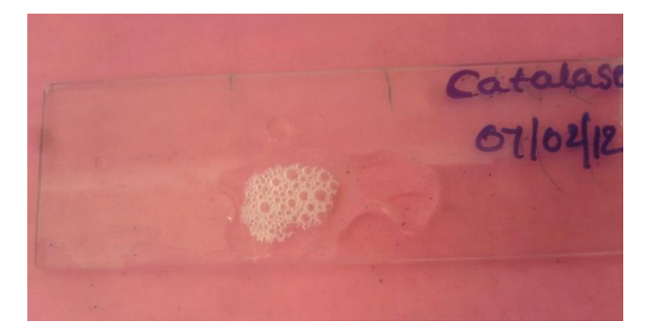
Figure3: Catalase Test for Staphylococcus sp.