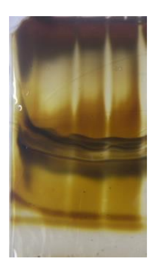
Figure: 2 Native PAGE for the crude extract from Artocarpus sp. with different concentrations (20µl, 30µl, 40µl and 50µl)