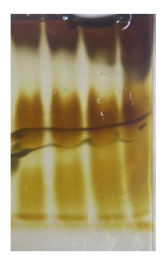
Figure: 3 Native PAGE for the dialysed sample of Artocarpus sp. with different concentrations (25µl, 35µl, 45µl and 55µl)

Figure: 2 Native PAGE for the crude extract from Artocarpus sp. with different concentrations (20µl, 30µl, 40µl and 50µl)