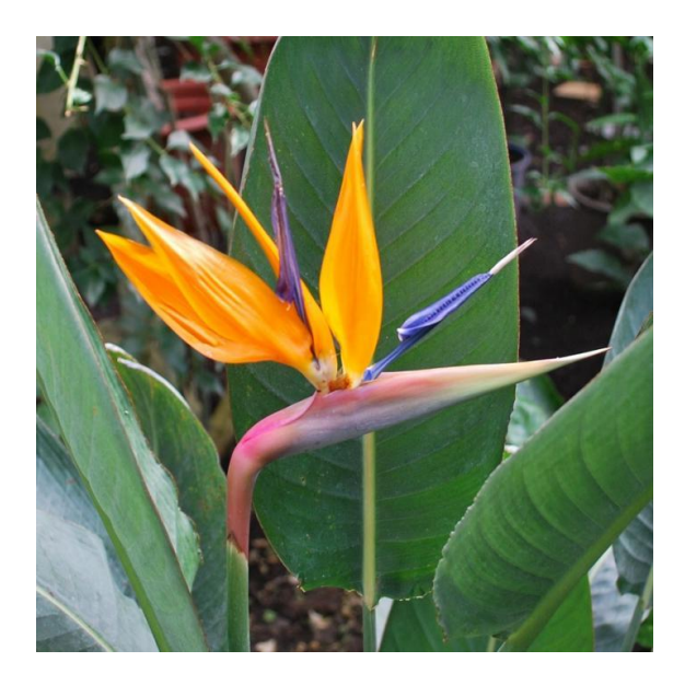
Figure 2. Flowering of Strelitzia reginae