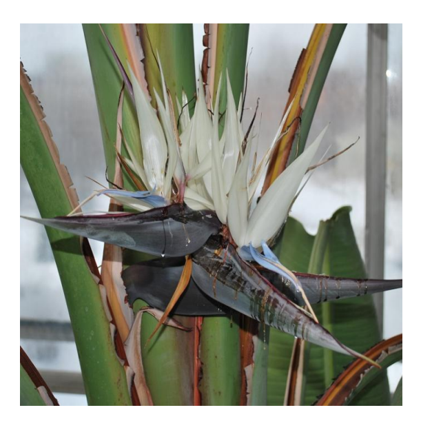
Figure 1. Flowering of Strelitzia nicolai

The seasonal development rhythm of S. nicolai and S. reginae in a greenhouse does not have a pronounced dormant period. The highest intensity of new leaves development was observed in the spring and in the summer, and the lowest - in the autumn, in the period between the end of fruit ripening and the beginning of stem growing. Specimens of S. nicolai can grow in the soil of a greenhouse and in pots, but potted plants do not bloom. Regular flowering occurred only on the stems that grow in the ground, and had reached the height of 6-10 m. The specimens of S. reginae were also grown in greenhouses in the ground and in pots. The specimens that grew in the ground were 4-5 times more powerful and bloomed more abundantly, as compared to the specimens grown in pots. The height of plants (leaves) was 1-1.5 m.