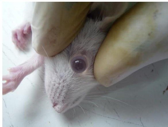
Figure 8: Galactose induced cataractous rat treated with Zincovit tablets (vitamin A: 5000 IU without grape seed extract) 160 mg/kg