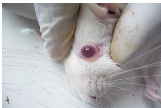
Figure 2: Galactose induced diabetic cataract control rat