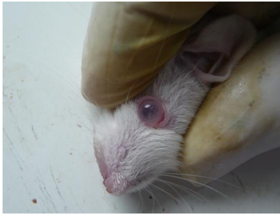
Figure 4: Galactose induced cataractous rat treated with Zincovit tablets (vitamin A: 2000 IU with grape seed extract) 80 mg/kg