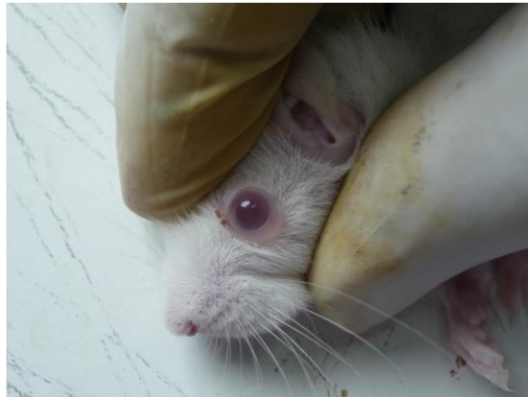
Figure 7: Galactose induced cataractous rat treated with Zincovit tablets (vitamin A: 5000 IU without grape seed extract) 80 mg/kg