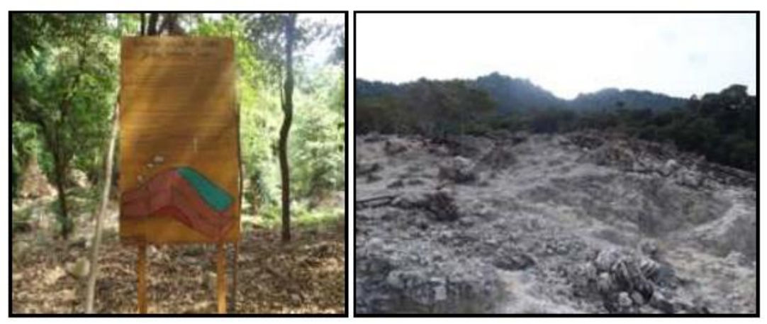
Figure 1. Sampling location in Jaboi village, Sabang

The results obtained are the highest composition is SiO2 as much as 96.9% whereas only 1.26% of alumina. This is consistent with the theory of reviews early that the main content of kaolin is silica. Geologically, the first forming of kaolin because the weathering process and hydro-thermal alteration in igneous rocks felspatik. Aluminum potash minerals silica and feldspar transformed into kaolin. Kaolinisasi process takes place in certain conditions, so that elements other than silica, aluminum, oxygen and hydrogen will experience exchange as shown in the following equation: 2KAISi3O8 + 2H2O \rightarrow AI2 (OH) 4 (SiO5) + K2O + 4SiO2 (Felspar kaolinite).