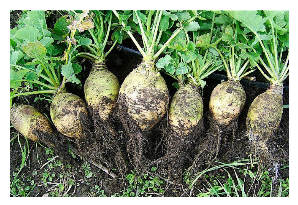
Figure 1: Roots kuuziku

In this context, particular attention should be paid concentrate-root diet feeding pigs, which uses a variety kuuziku fodder turnips (Figure 1).