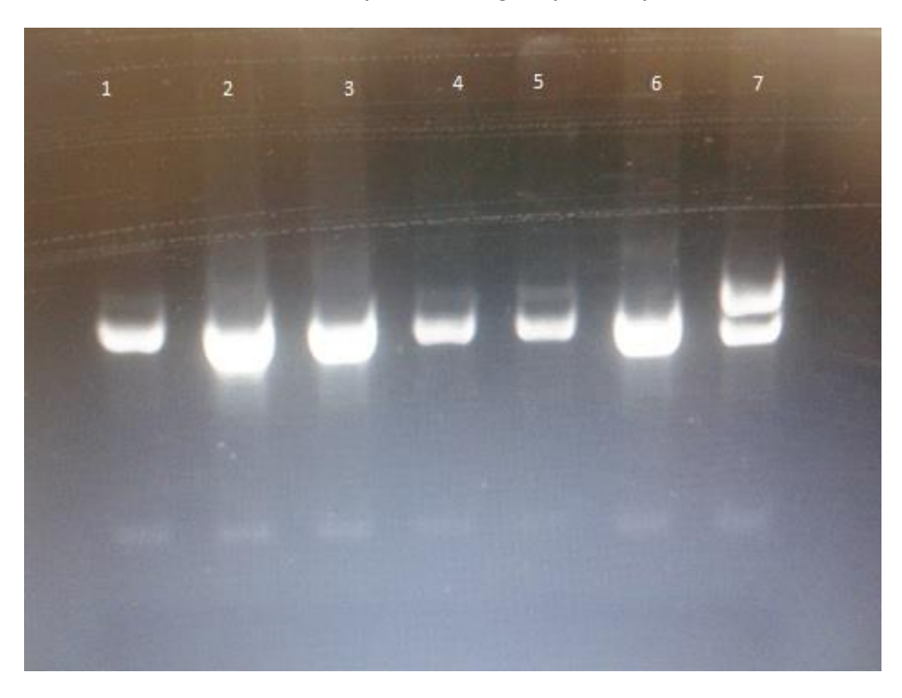
Figure 2: Photograph of 2% agarose of Apo B showing : lane 1 : patient pre –transplantation and lane 2 donor , lane3: patient post transplantation showing CC. Lane 4&5: another donor and patient post transplantation showing CC. Lane 6 & lane 7 : another pre-transplantation pair showing informative locus