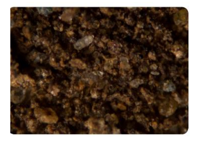
Figure 3: Sand grains as observed under 40x