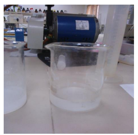
Standard solution of paracetamol