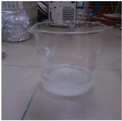
Standard solution of combiflam

For preparing standard solutions of combiflam and paracetamol, take one tablet of each and add to their respective labelled beakers. The heat the mixtures until a clear solution is obtained. Heating each solution for around 1 minute will give a clear solution.