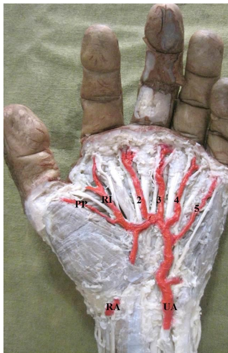
Figure 1: Left hand showing Complete SVA (complete radio-ulnar communication). UA –Ulnar artery; RA – Superficial branch of the radial artery; PP – Arteria princepspollicis, RI – Arteria radialisindicis; 2,3,4 – 2 nd , 3 rd and 4 th common digital arteries; 5 – Proper digital artery.

Complete SVA – It was further subdivided into Type 1 (complete radio-ulnar communication) (Figure. 1) and Type 2 (radio-medio-ulnar communication) (Figure. 2). Thirty four hands showed type 1 and one hand showed type 2 complete SVA.