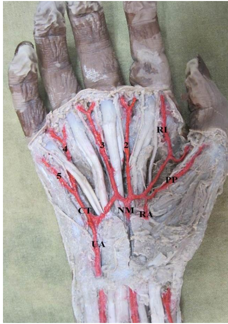
Figure 2: Right hand showing a Complete SVA (radio-medio-ulnar communication). UA – Superficial branch of ulnar artery; RA – Superficial branch of radial artery; NM – Arteria Nervi Mediana; RI – Arteria radialisindicis; PP – Arteria princepspollicis; 2, 3, 4 – 2 nd , 3 rd and 4 th common digital arteries; 5 – Proper digital artery; CT – common trunk for 4 th common digital artery and proper digital artery for the little finger.

Incomplete SVA – It was further subdivided into Type 1 (radio-ulnar type without communication between radial and ulnar arteries) (Figure. 3), Type 2 (ulnar type, with ulnar artery supplying the medial three and a half digits and rest by the superficial branch of radial artery) (Figure. 4), Type 3 (ulnar type, with ulnar artery supplying the medial three and a half digits and rest by the deep branch of radial artery) (Figure 5.). Nine hands showed type 1, five hands showed type 2 and one hand showed type 3 incomplete SVA