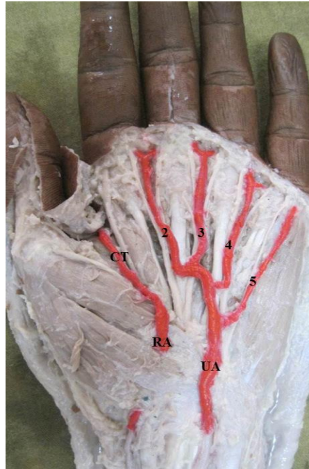
Figure 4: Left hand showing an Incomplete SVA(ulnar type, with ulnar artery supplying the medial three and a half digits and rest by the superficial branch of radial artery).UA – Superficial branch of ulnar artery; RA – Superficial branch of radial artery; 2, 3, 4 – 2 nd , 3 rd and 4 th common digital arteries; 5 – Proper digital artery; CT – common trunk for arteria princepspollicis and arteria radialisindicis.