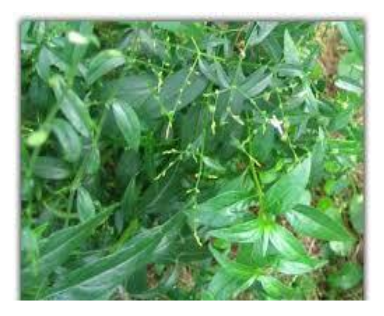
Figure 1: Andrographis paniculata

Andrographis paniculata belongs to the genus Andrographis that is widely used for decades due to its known biological activities.