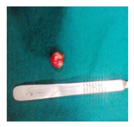
Figure 5: Excised cyst