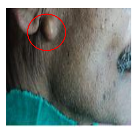
Figure 1: A soft, painless swelling on the right pre auricular region (lateral view)

There are no specific rules for treating these lesions because they are mainly congenital. With the growth of dermal and epidermal cysts, patients usually complain of a weak pain in the area where the cyst is localized. They also experience certain bulbous motility disorders that can be transitory or permanent [7]. Treatment consists of complete removal of the cyst [1]. There is low recurrence rate, since fibrous capsule that surrounds the cyst makes it easy to enucleate in toto [8]. About 5% of dermoid cysts undergo malignant transformation, but only for the teratoid type [2].