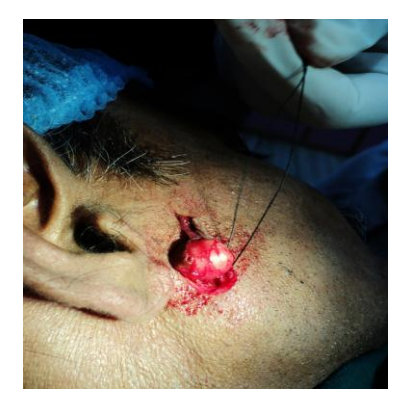
Figure 4: Surgical excision of the cyst