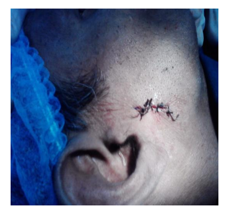
Figure 6: Wound closure