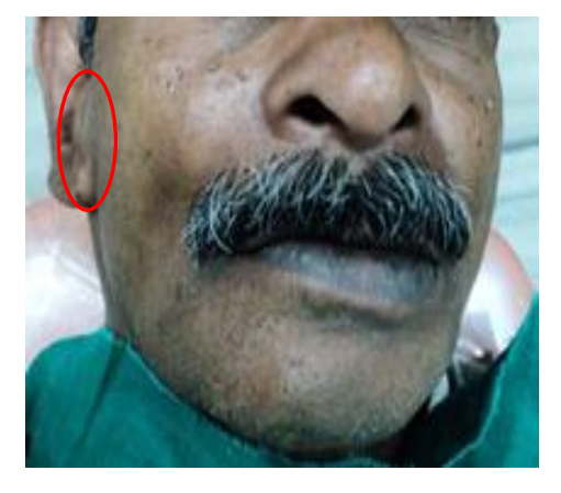
Figure 2: A soft, painless swelling on the right pre auricular region (anterior view)