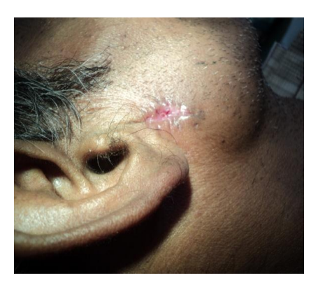
Figure 7: 7 days post-operative picture