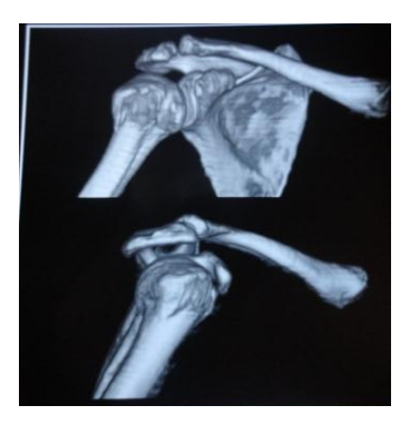
Figure 2: Reconstruction CT right shoulder of the patient- without any secondary lesions