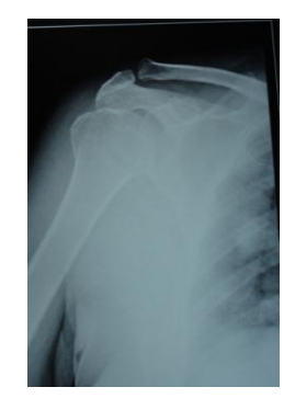
Figure 1: Radiograph of right shoulder of the patient

A 50 year old lady presented with pain in her right shoulder and difficulty in moving her right shoulder after a fall in a platform near her house. On the time of fall she first landed her head on to bonnet of a car and then fell side on to the ground. She did not have any loss of consciousness. One year back, she had undergone total mastectomy for carcinoma of her right breast and because at that time, she did have low platelet counts, she could not be given chemotherapy. However she was asymptomatic till the day of fall. Her examination revealed swelling in her right shoulder with all movements of her right shoulder were restricted. Her radiographs are seen in figure 1. There was a fracture in the upper humerus with an angulation.