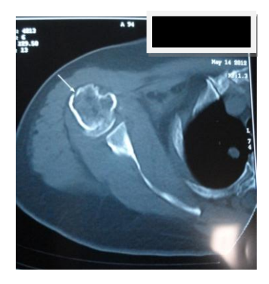
Figure 3.CT of the right shoulder of the patient with the fracture of proximal humerus is marked by an arrow. The facture site didnot show any secondary lesions