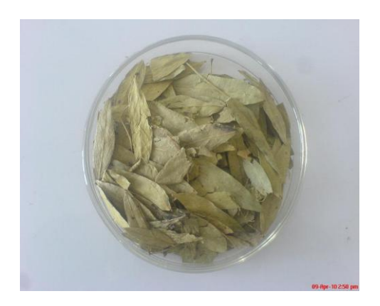
SENNA DRIED LEAFLETS

From the above description it is quite understandable that microwave assisted extraction is a very efficient method for extraction of key components from plant materials. Paré (1995), in his patent listed the application of microwave-assisted extraction on various plant materials and showed that 40s to around two minutes microwave irradiation treatment to sea parsley, pepper mint leaves, cedar, garlic obtained extracts of interest compared to that obtained by 90 min to several hrs of steam distillation or similar standard methods. It is suggested by Paré (1995b) that the microwave is better in extracting heat sensitive component than distillation method.