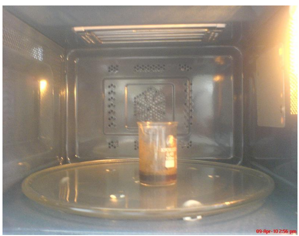
MICROWAVE EXTRACTION OF CALCIUM SENNOSIDES

Calcium Sennoside from senna leaflets was extracted by varying the parameters of amount of solvent used, temperature and time. The extraction was performed thrice with varying results.