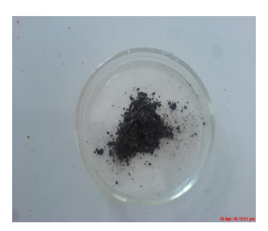
Conventional extraction Product