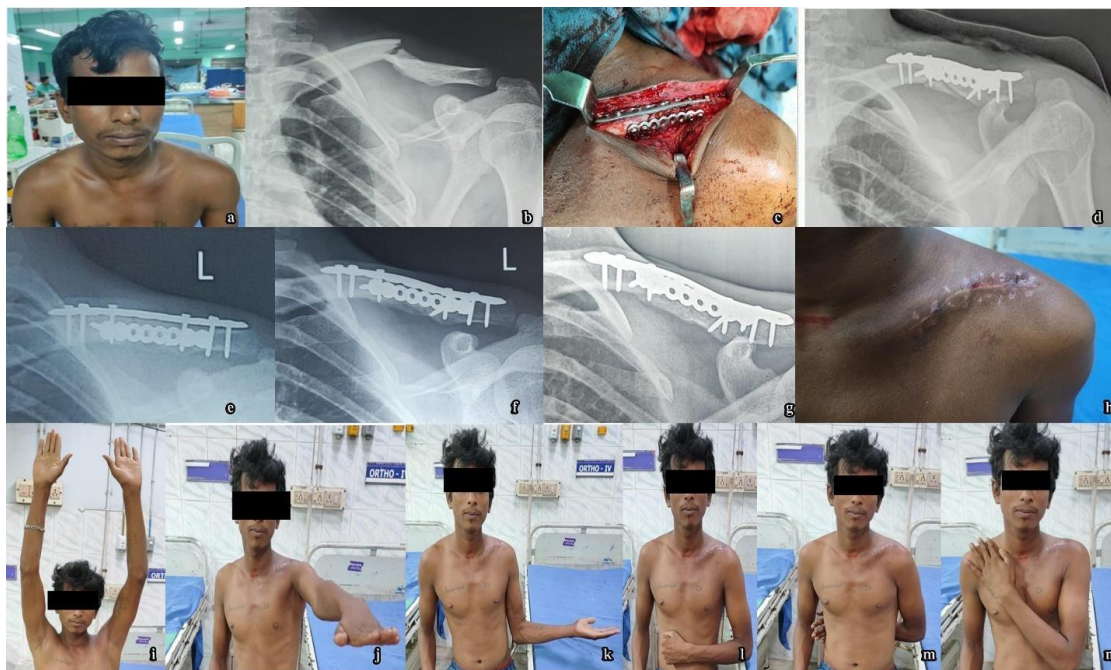
Figure 1: Case 1 – a) pre-operative clinical image b) Pre-operative X ray c) Intra operative image d) Immediate post-operative X ray e) X ray at 6 weeks follow up f) X ray at 3 months follow up g) X ray at 6 months follow up h) post-operative surgical scar i-n) Range of movements during follow up