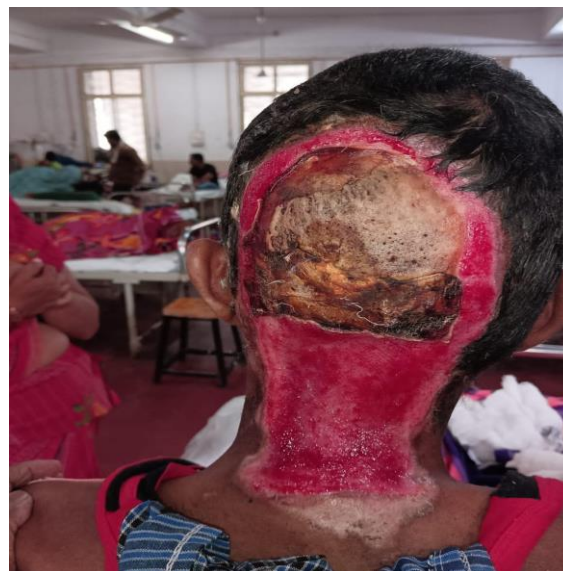
Figure 5: On discharge with serial debridements