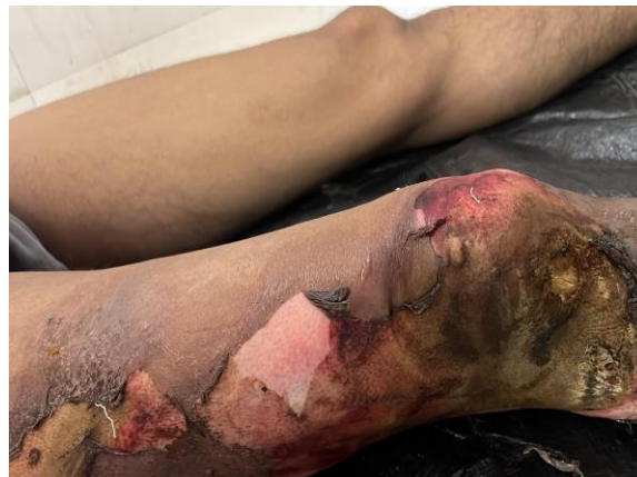
Figure 3 and 4: On admission