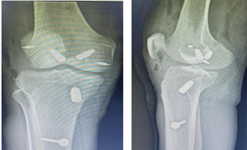
Case 3: KD - II