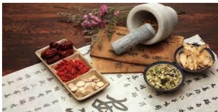
Figure 2: Chinese herbal medicines

Chinese herbal medicine contains ginkgo and ginseng. Ginseng medicine is used for a specific treatment. It is used to restore balance to the body as a whole. This medicine can be taken in some form like pills, powder, and tea can also be taken along with it [8].