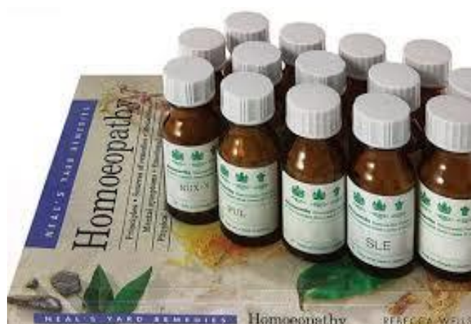
Figure 3: Homeopathy Medicine