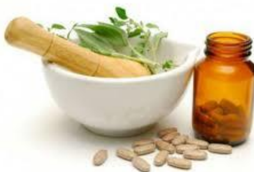
Figure 1: Ayurveda medicine