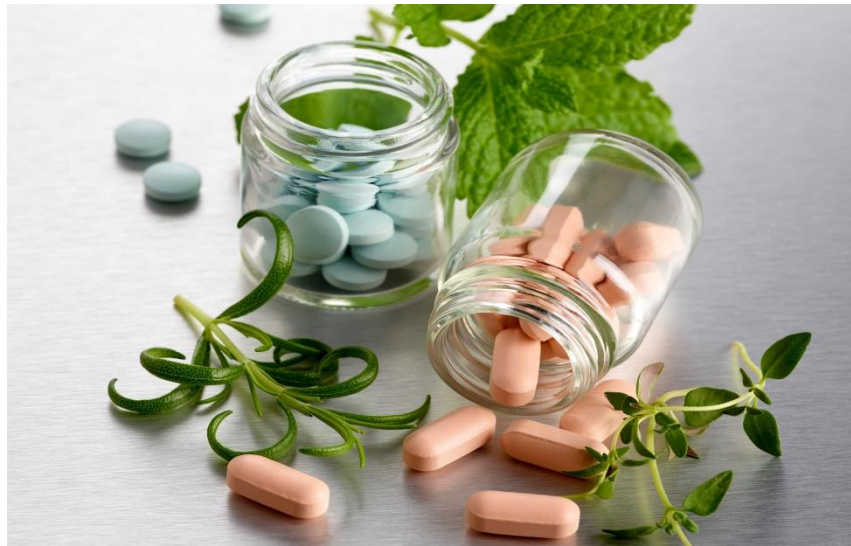
Figure 4: Homeopathy remedies

Some of the principles are produced after Homeopathic remedies. Whenever any remedies are made in homeopathic it is made again and again so as to provide a good result. We can adulterate remedies with matter 1000 times. We can dilute remedies from 1000 to 10000 times. Homeopathic has been told from the beginning to detail all the experiments that were done on the patient. There is something in it like physical question also from like mentally, emotional or is there an emotional illness [11].