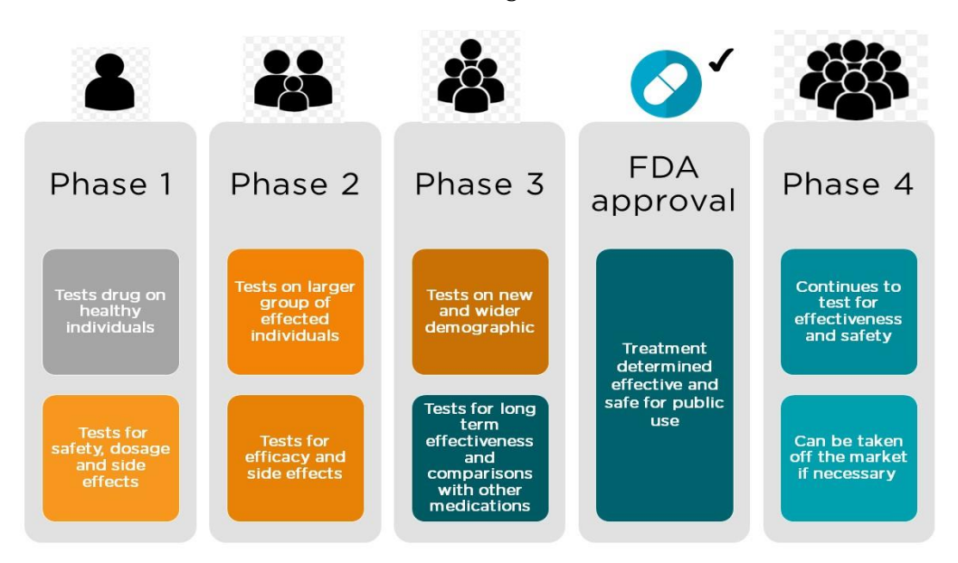
Figure 3: Phases of Clinical Trials

Phase 4 trials are conducted when the drug or device has been approved by FDA. These trials are also recognized as post-marketing surveillance involving pharmacovigilance and continuing technical support after approval. There are numerous observational strategies and assessment patterns used in Phase 4 trials to evaluate the efficacy, cost-effectiveness, and safety of an involvement in real-world settings. Phase IV studies may be required by regulatory authorities (e.g. change in labelling, risk management/minimization action plan) or may be undertaken by the sponsoring company for competitive purposes or other reasons. Therefore, the true illustration of a drug 's safety essentially requires over the months and even years that mark up a drug's lifespan in the market. FDA reviews reports of complications with prescription and OTC drugs, and can decide to add precautions to the dosage or practice information, as well as other events for more serious adverse drug reactions.<sup>[17]</sup>