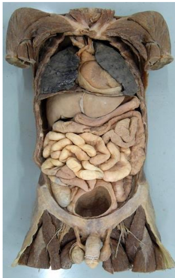
Figure 3: Dissected adult male cadaver using fourth incision