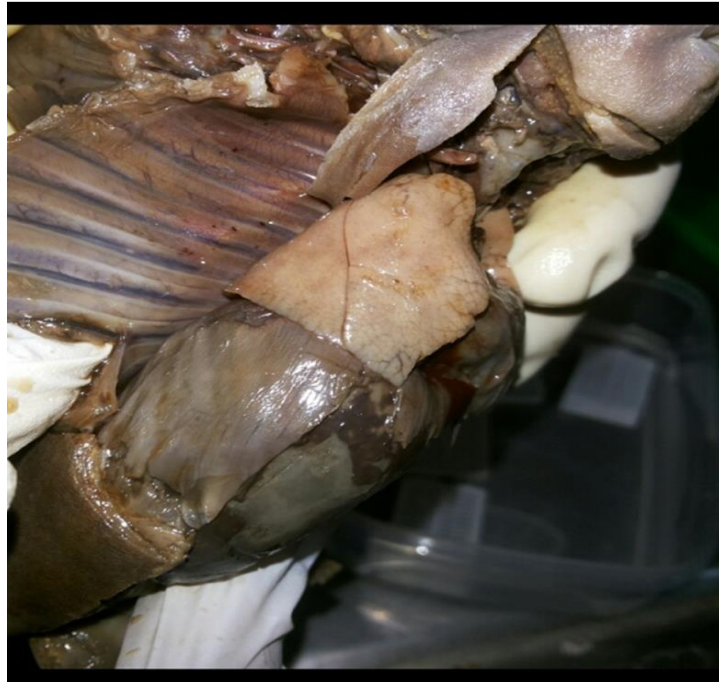
Figure 2: Dissected 30 weeks fetus using fourth incision