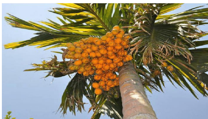
Figure 1: Areca palm tree with ripe fruits

Areca Palm is commonly known as betel palm, catechu tree/palm, supari palm, Areca catechu or Dypsis lutescens tree etc and the tree fruit/ seed is commonly known as areca nut, betel nut or supari. Areca Palm is a perennial evergreen plant belonging to Arecaceae Family. Areca nut exhibits pleasant aromatic odour, astringent property, psychoactive property and bitter in taste. It is widely distributed in Regions of South Asia, India, china, Bangladesh, Myanmar, Malaysia, Thailand, Vietnam, and Philippines etc. In India, largest production sector of areca nut in the world and it is widely consumed/ used in India. Areca nut is a most addictive substance after nicotine, alcohol, caffeine in the world and it is easily consumed by youngsters/children. Numerous research reports data shown that the many users believe/trust that the consumption of areca nut is useful for the digestion and also possess euphoric (Joyful/excited) effect. In century year ago, Indian and foreign peoples also believed that the nut of the plant is exhibits many medicinal/pharmacological property. In India, areca nut and leaves of the plant is believed as sacred Plant and according to people's faith the ritual fuctions is incomplete without the use of nuts and leaves of the plant is also useful for the decoration purpose.