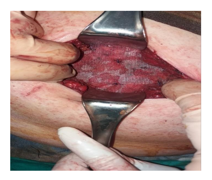
Figure 2: Mesh in the sub-lay position