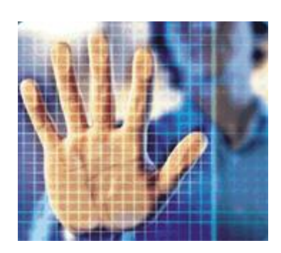
Fig 4: Hand

When compared to all other biometrics vein Recognition has more advantage because the veins are present beneath the skin and unique for every person. So, they are not possible to forge and also they can't obtain from dead bodies.