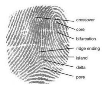
Fig 1: Finger print

Some of the implemented biometrics are finger print, face, iris, palm and vein. These are major biometric approaches in present life. Unlike finger print and iris in which finger print sensor is contact based and also it can be forged.