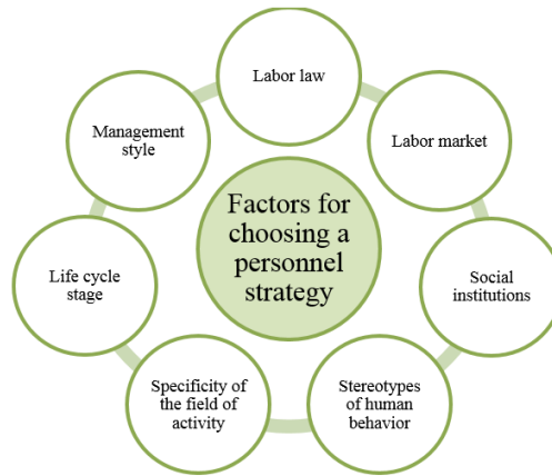
Figure 1: Factors of choice the personnel strategy into organization