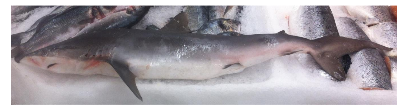
Figure 1: The milk shark Rhizoprionodon acutus in the Auchan. The shopping and entertainment center "Filion", Moscow.

One adult milk shark Rhizoprionodon acutus Rüppell, 1837 (Carcharhiniformes), caught in the Indian Ocean, was studied. The country of shark's origin was Sri Lanka. The whole fish was delivered to the Auchan trading network (Moscow) in a chilled state for sale (Figure 1).