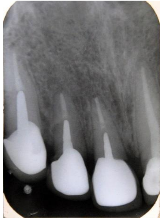
Figure 6: 7 years follow-up radiograph showing teeth 11,12 and 13 with periodontal healing and normal bony trabecular patterns

The patient was periodontally healthy during the follow-up period. No relapse occurred by the end of seven years. The tooth did not show any signs of the root resorption during the treatment and follow up periods. Seven-years follow up radiograph revealed normal trabecular bony pattern. (Figure 6)