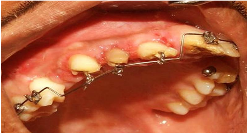
Figure 3: After crown lengthening - crown length of 4.5 mm achieved