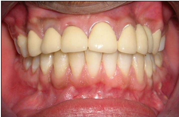
Figure 5: PFM Crowns cemented