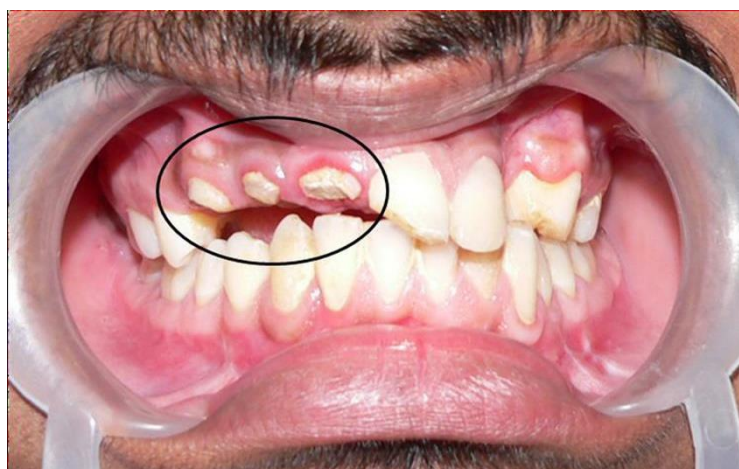
Figure 1: Pre-operative view

The crown-root fracture was of chisel type, extending below the alveolar crest palatally and with circumferential probing depths of 1.0-mm, the biologic width had not been directly violated by the fracture. At the same time, however, there was inadequate tooth structure to achieve a ferrule effect following reconstruction with a post and core and crown. (Figure 1)