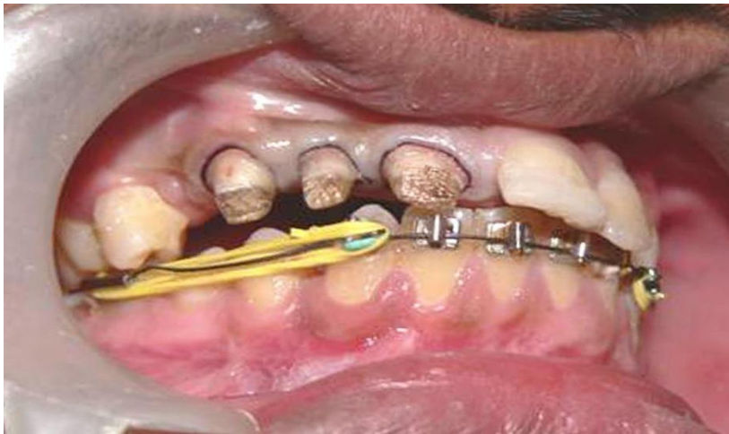
Figure 4: Custom-cast gold post and core cemented irt 11, 12 and 13