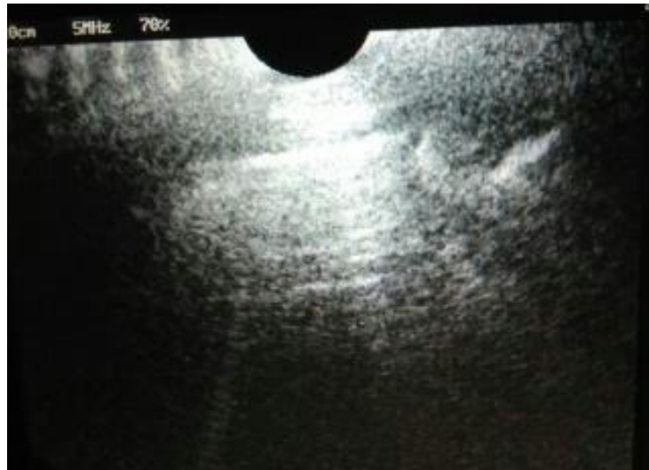
Figure 1. The boundary line between the abomasum and abdominal cavity

As Figure 1 shows, the ultrasound examination showed a hyperechoic zone, which is characteristic of this pathology. Hyperechoicity is explained by the presence of gas formed in the abomasum and the very high pressure caused by it, which makes the ultrasound glow.