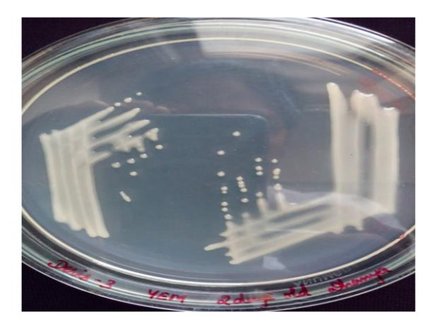
Figure 1: Burkholderia sp. YU16-RN3

Overall, 12 mucoid colonies were isolated from the root nodules of the plant Derris elliptica . Out of those only two colonies showed prominent mucoidal growth were selected based on their morphological differences observed on YEM solid medium to study further. The strains were named as YU16-RN3 (Figure 1) and YU16-RN5 (Figure 2) and were used to evaluate EPS production in YEM broth.