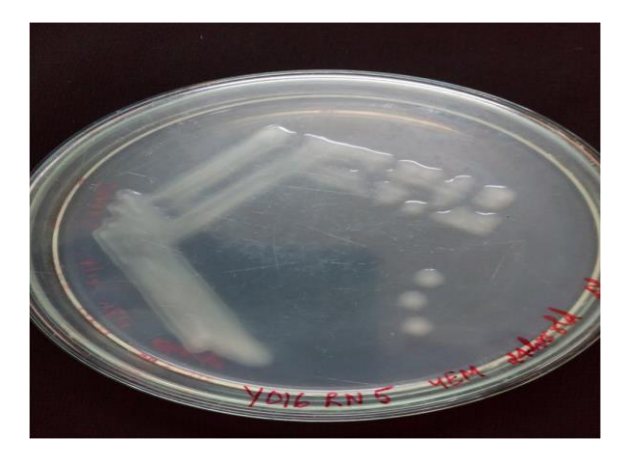
Figure 2: Enterobacter sp.YU16-RN5