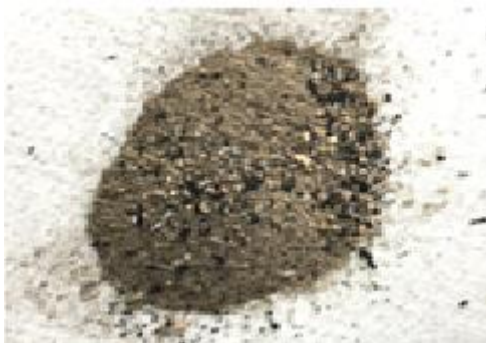
Figure 1: Solid pyrolysis product after ashing

pH, mineralization, specific electrical conductivity, and macro-ion content were determined in the aqueous extract of the test sample. The results of measurements and normative indices for water bodies are given in Tables 1-2. For comparison, the tables demonstrate the maximum permissible concentration of the ingredient in the drinking water (TLV drinking water ), the maximum permissible concentration of the ingredient in the water of fishery reservoirs (TLV open reservoirs ), the permissible concentration of pollutants in the wastewater admitted for discharge to the centralized water disposal system (LV wastewater ) [10].