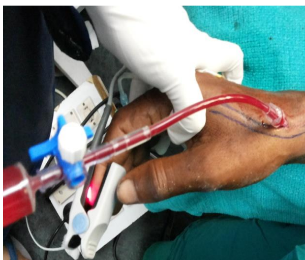
Figure 1: showing a 20G iv cannula in the superficial radial artery and backflow of bright red blood from it