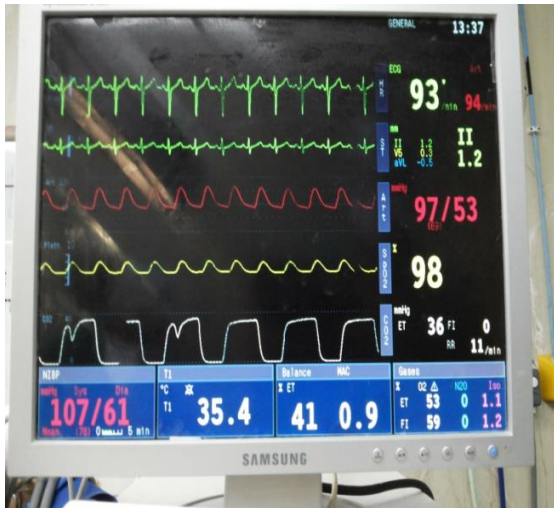
Figure 3: Monitor displaying the arterial waveform after connecting the pressure transducer to the cannula