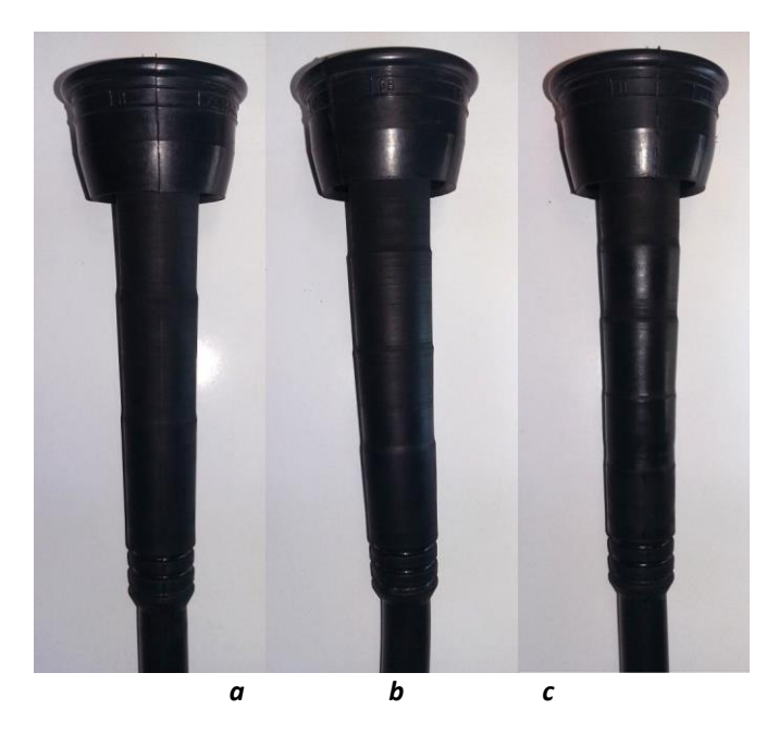
Figure 1: General view of the teat tubes of the milking machine with the number of steps : a) - three; b) - four; c) – five

To increase the intensity and completeness of milking, a milking machine with stepped nipple tubes is offered, containing a pulsator, a collector, milk tubes and four teat cups, each of which consists of a stepped nipple tube with a different number of steps located in the sleeve(Figure 1).