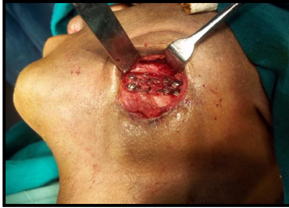
Exposure of previous placed miniplates at The primary fracture site