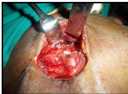
Mucoperiosteal flap reflection with Risdons Submandibular incision