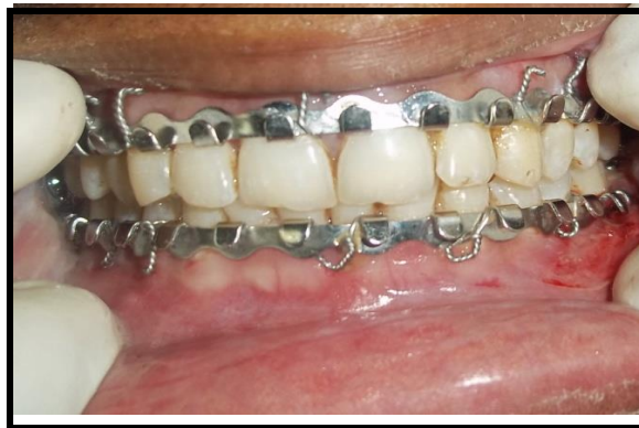
Corrected malocclusion post-operatively