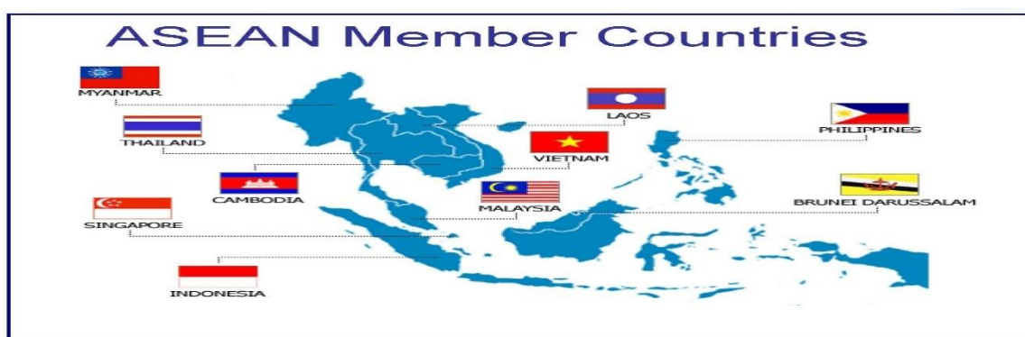
Figure 1: ASEAN Nations