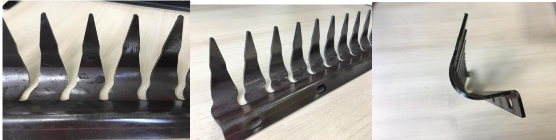
Figure 2: Comb with tangential channel

The sequence of experiments was following: preliminary setting up and preparation of the device for carrying out the experiment. For this purpose a cowling together with a serial rotor was removed and the modernized sample of the rotor was installed. It was equipped with combs with the tangential channel (Figure 2).