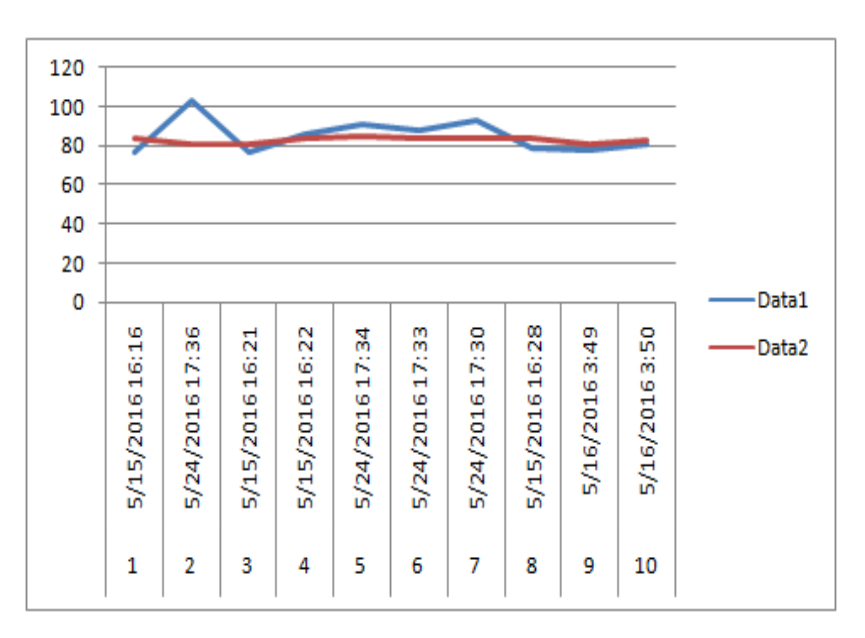
Figure 5: Time versus heartbeat and temperature

Figure 3 & 4 shows the relationships between time & heart beet, time & temperature and time & heart beat and temperature. Here observes the temperature of patient through the temperature sensor LM 35 and also it observes the pulse rate or heartbeat of the patient through the heart beat sensor. Then after words it checks the reference readings of temperature and heartbeat. Whenever the readings exceed the normal values of heart beat and temperature then the values uploaded to server also u will get a message and call. If the heart beat is exceeding the critical value (Here the critical value of heart beat sensor is 78) then the heart beat values is send to server, also u will get a message and call. If the temperature is exceeding the critical value (103F) then the temperature values are uploaded to server also u will get the message and call.