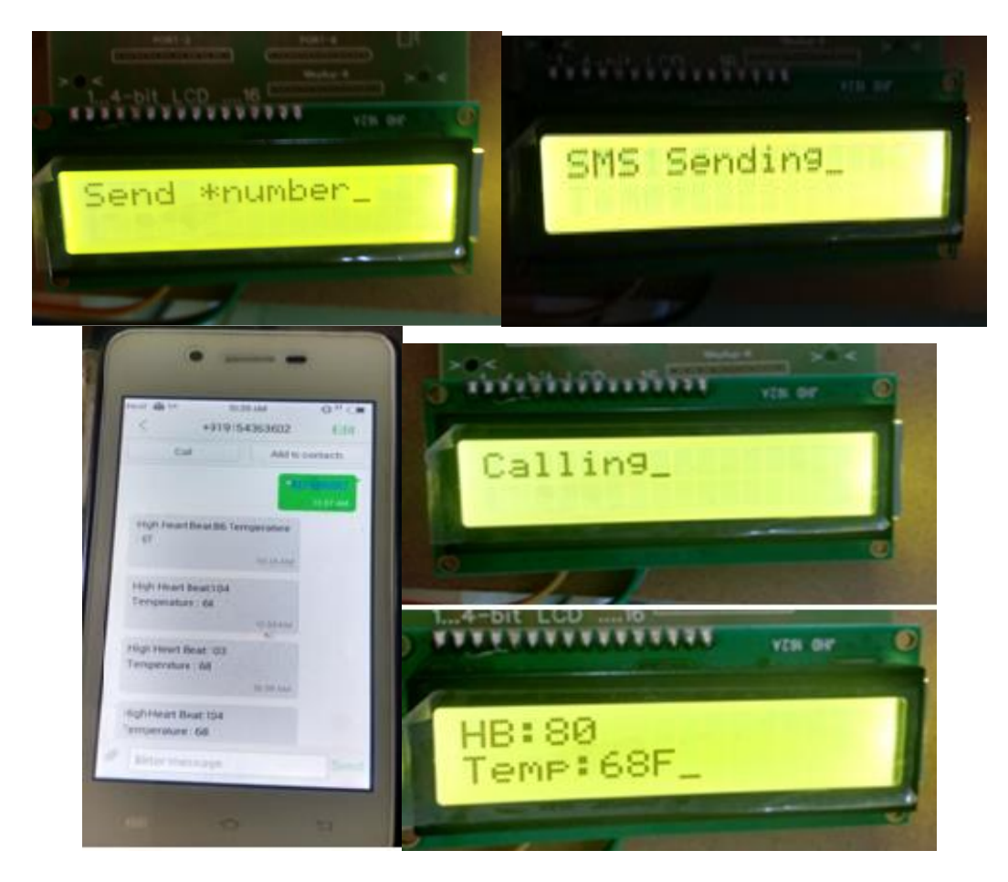
Figure 2: Heart beat and temperature values display and sending to mobile