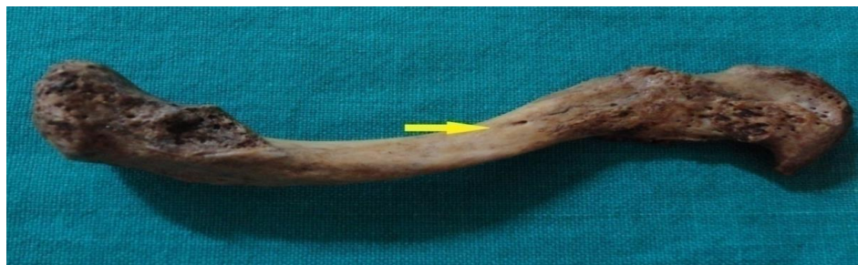
Figure 8: Direction of the nutrient foramen towards the acromial end.

In 98 (95.1%) clavicles, the foramen were directed toward the acromial end and in 5 (4.8%) clavicles had medially directed foramina [Table 4]. The average whole length of the human adult clavicle was 10.9 – 16.9cm and the mean value of the whole length was about 142.68mm (14.268 ± 1.2035). The average distance of the nutrient foramen from the sternal end of the clavicle was about 0 - 11.6 cm and the mean value of the sternal end was about 67.65mm (6.765 ± 2.3404) [Table 5]. By using Hughe’s formula the mean foraminal index was 47.31%. The average length of the clavicle was 14.4cm. By using Hughes’s formula the mean foraminal index was 47.31% [Table 5].