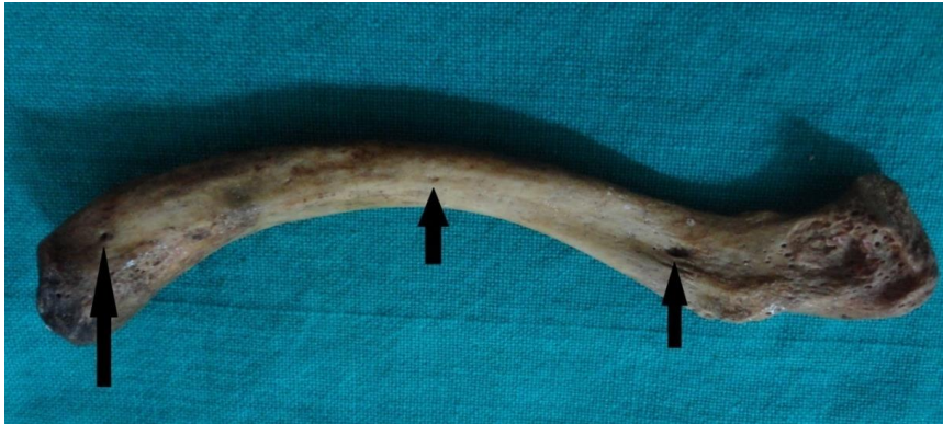
Figure 1: Clavicle with multiple foramen.