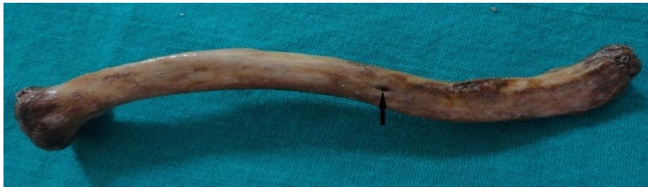
Figure 4: Nutrient foramen in the superior surface of the clavicle.