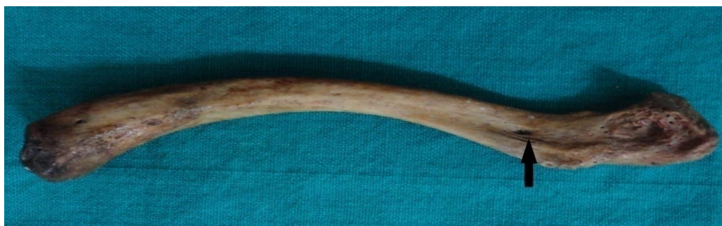
Figure 7: Location of the nutrient foramen in the lateral 1/3 rd of the clavicle.