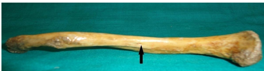
Figure 2: Nutrient foramen in the posterior surface of the clavicle

The foramen was observed at the middle 1/3 region in 100 (90.9%) clavicles, at the medial 1/3 region in 13 (11.8%) clavicles and at the lateral 1/3 region in 7 (6.3%) clavicles. The foramen was on the inferior surface in 34 (30.9%) clavicles, on the posterior surface in 80 (72.7%) clavicles and on the superior surface 6 (5.4%) clavicles. The foramen were observed at the posterior surface of the medial 1/3 rd of the clavicle in 10 (9.1%), at the inferior surface of the medial 1/3 rd of the clavicle in 3 (2.7%), at the posterior surface of the middle 1/3 rd of the clavicle in 70 (63.6%), at the inferior surface of the middle 1/3 rd of the clavicle in 24 (21.8%), at the superior surface of the middle 1/3 rd of the clavicle in 6 (5.5%), at the inferior surface of the lateral 1/3 rd of the clavicle in 7(6.4%). [Table 2]