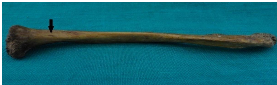
Figure 5: Location of the nutrient foramen in the medial 1/3 rd of the clavicle.