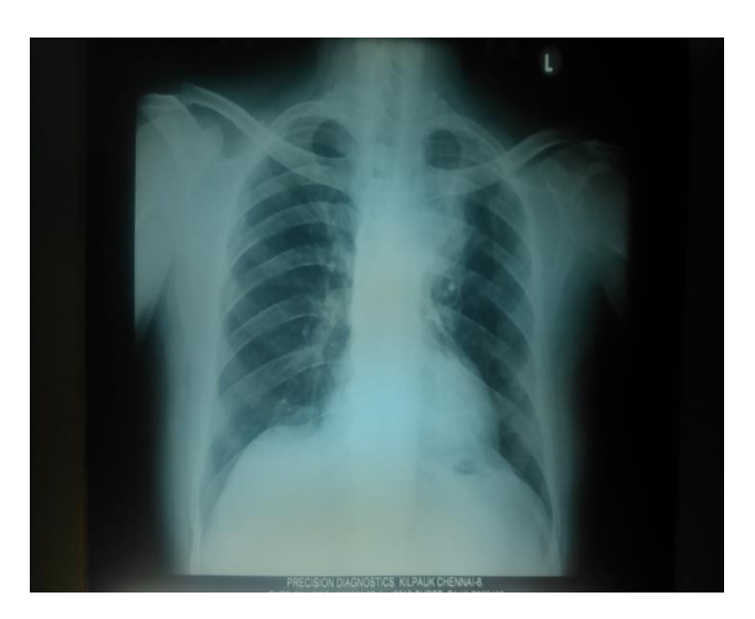
Figure 1: Chest X-Ray PA view

Chest X ray showed irregular non homogenous opacity in the left upper zone. This was followed up with a CT scan of the chest showing air space consolidation with the surrounding ground glass opacities in the apico –posterior and anterior segment of the left upper lobe.