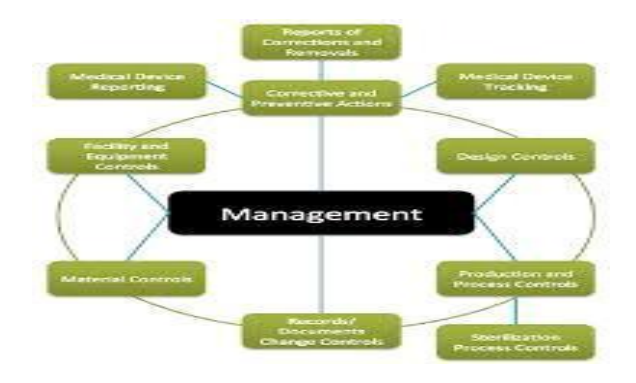
Fig.1: Management architecture

It is difficult for electronic healthcare systems to have an understanding of the understanding contents of the unstructured and narrative texts with no trouble on the grounds that they are composed of heterogeneous grammatical buildings, diversified expressions expressed in various common languages as well as using diverse phrases to denote a single concept. Therefore, the healthcare domain is characterized by means of ambiguity. Hence, the accessibility to valuable and significant healthcare expertise for prognosis and healing in a timely manner becomes a undertaking [1]. Accordingly, the healthcare procedure is characterized by excessive fee and excessive error charges. Nevertheless, ordinary Language Processing (NLP) strategies have been used to structure know-how in healthcare systems by extracting valuable information from narrative texts so that you could furnish information for determination making. For this reason, NLP approaches minimize healthcare fee and they are additionally large for the development of healthcare approaches. It's for that reason in contrast historical past that this paper examines NLP procedures utilized in healthcare, their importance to the healthcare domain as good as their boundaries in healthcare.