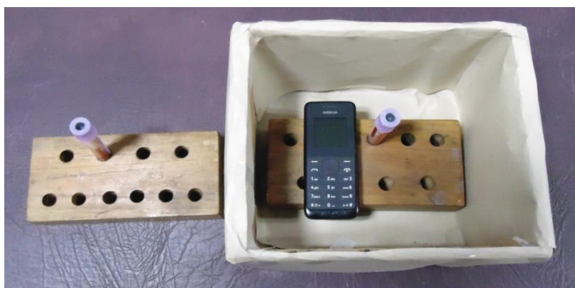
Figure 1a: Test sample kept at a distance of one cm from mobile phone (Dual band EGSM 900/1800 MHz). Control sample kept under identical condition outside the box.

Immediately after exposure to cell phone radiation, both specimen (control and exposed) were analyzed for osmotic fragility, RBCs count, WBCs count and platelet count.